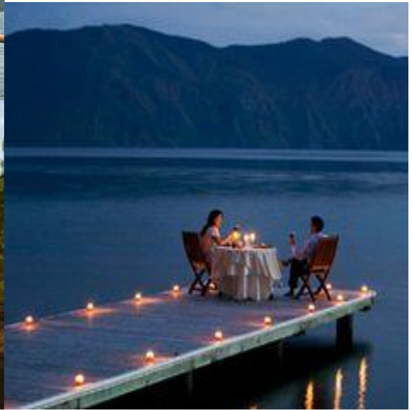
Meet me in the Mountains